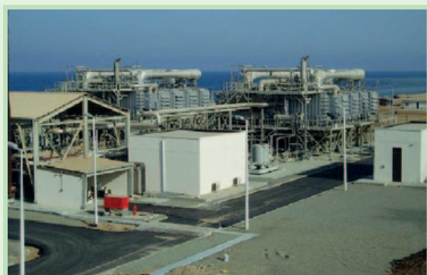
Desalination plant / Rabigh in Saudi Arabia

On the other hand, diverse types of fibre-reinforced plastic (FRP) are used, mainly for pipes in sections that become wet with low-temperature seawater. Since they do not corrode,