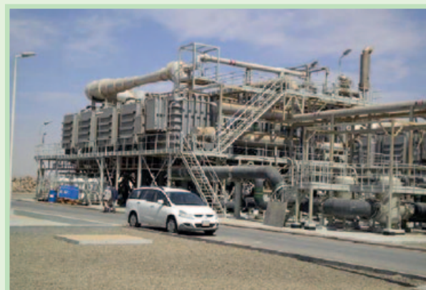
Desalination plant / Rabigh in Saudi Arabia

there is no problem with their reliability in this application. To date they have not been used for other applications such as evaporator vessels, pumps or large storage tanks. Plastic pipes are not used for high-pressure piping since their pressure- and heat-resistance properties are not high enough.