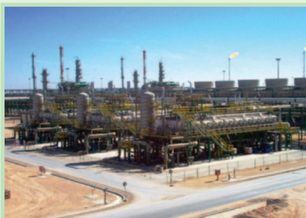
MSF evaporator made of solid duplex stainless steel, 2205, for Melittah

Lean duplex is a cost-effective duplex stainless steel which has lower nickel and molybdenum content than 2205 /1.4462. Corrosion resistance is very close to that of grade 316L/1.4404. The high strength of Lean duplex makes it possible to reduce the gauge by up to 50% compared with austenitic 300 series grades. However, restrictions in design codes limit the real savings to around 35 to 40%. 3