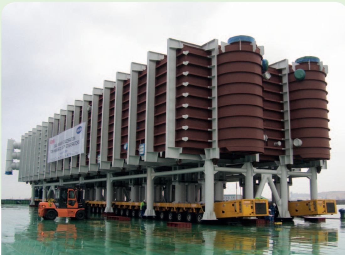
MED type evaporator of Marafiq IWPP in Saudi Arabia

Successful desalination requires a material that can resist the aggressive corrosion caused by seawater and brine. Utilising stainless steel to create fresh water further increases the sustainability profile of the desalination industry. The durability and minimal maintenance requirements of stainless make it a good choice economically. The high-level of recycled content and 100% recyclability at the end of its life are the cornerstones of stainless steel's environmental profile. High performance stainless steels, including duplex grades, are the perfect choice for desalination.