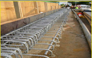
Stainless Bar Sales