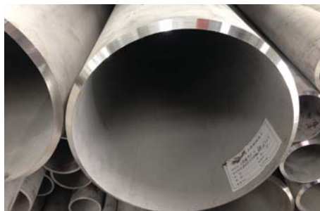
Super duplex 2750 seamless pipe with brand name Dingxin , from China.

The difference is measured by their ability to withstand chloride-induced pitting, as measured by the pitting corrosion resistance equivalent (PRE or PREN). This is calculated by the formula PREN = 1 \times Cr + 3.3 \times Mo + 16 \times N . Alloys with a PRE of more than 40 are considered super duplex; SAF 2507 SD has a PRE of 42.5. A grade is called "hyper duplex" if its PRE number is 48 or more; SAF 2707 HD has a PRE of 48, and SAF 3207 HD has a PRE of 50. The lower-alloyed, less corrosive resistant duplex grades (e.g. LDX 2101 and 2304) are considered lean. Conveniently, duplex grades are often designated by a four-digit number that indicates the chromium percentage in its first two digits and the nickel percentage in its last two. Thus lean duplex grade 2304 contains 23%Cr and 4%Ni.