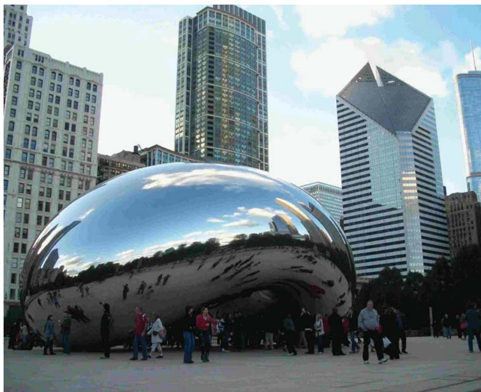
Highly reflective stainless steel 316L from Outokumpu helps to lend Anish Kapoor's Cloud Gate sculpture in Chicago's Millennium Park the appearance of mercury.

Each group has its strengths and limitations. Austenitics have good formability and ductility, and types 304 (18-20%Cr and 8-10.5%Ni) and 316 (16-18%Cr and 10-14%Ni) are among the most frequently specified grades. Nickel being more expensive than manganese, many end users prefer to