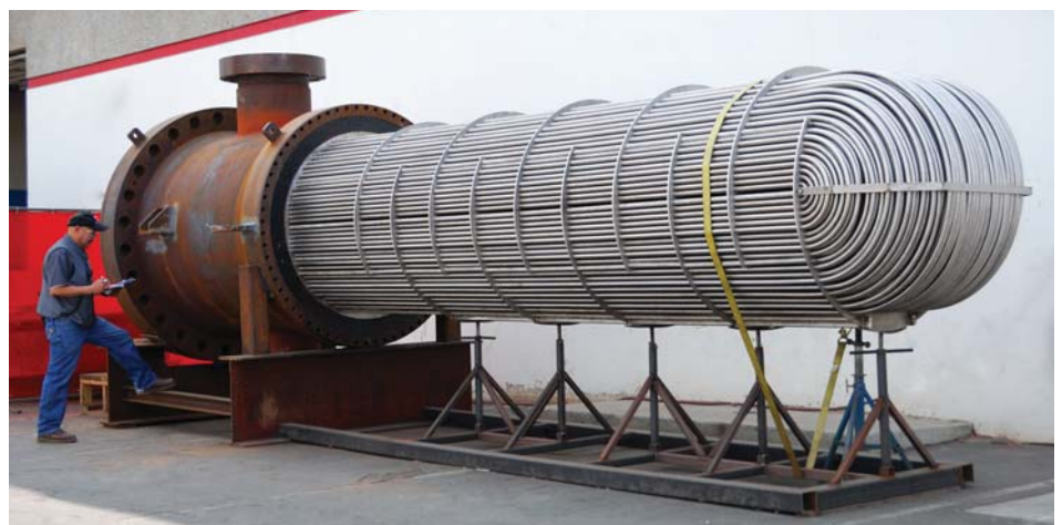
Inconel alloy 625 is suitable for seawater applications because of its excellent corrosion resistance and resistance to chloride-ion stress-corrosion cracking. Depicted here, a shell and tube heat exchanger in alloy 625.

Apart from nickel, other materials can constitute the chief alloying element of superalloys, including cobalt and titanium.