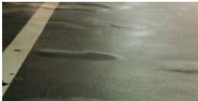
Left: Cross-section of slab before and after; Right: Delamination of the asphalt